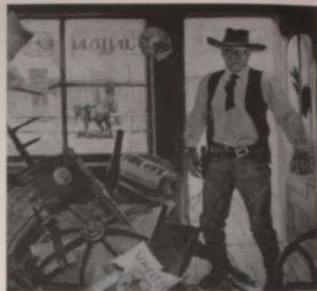
Jacket design of Edit with Lead : Off-trail.