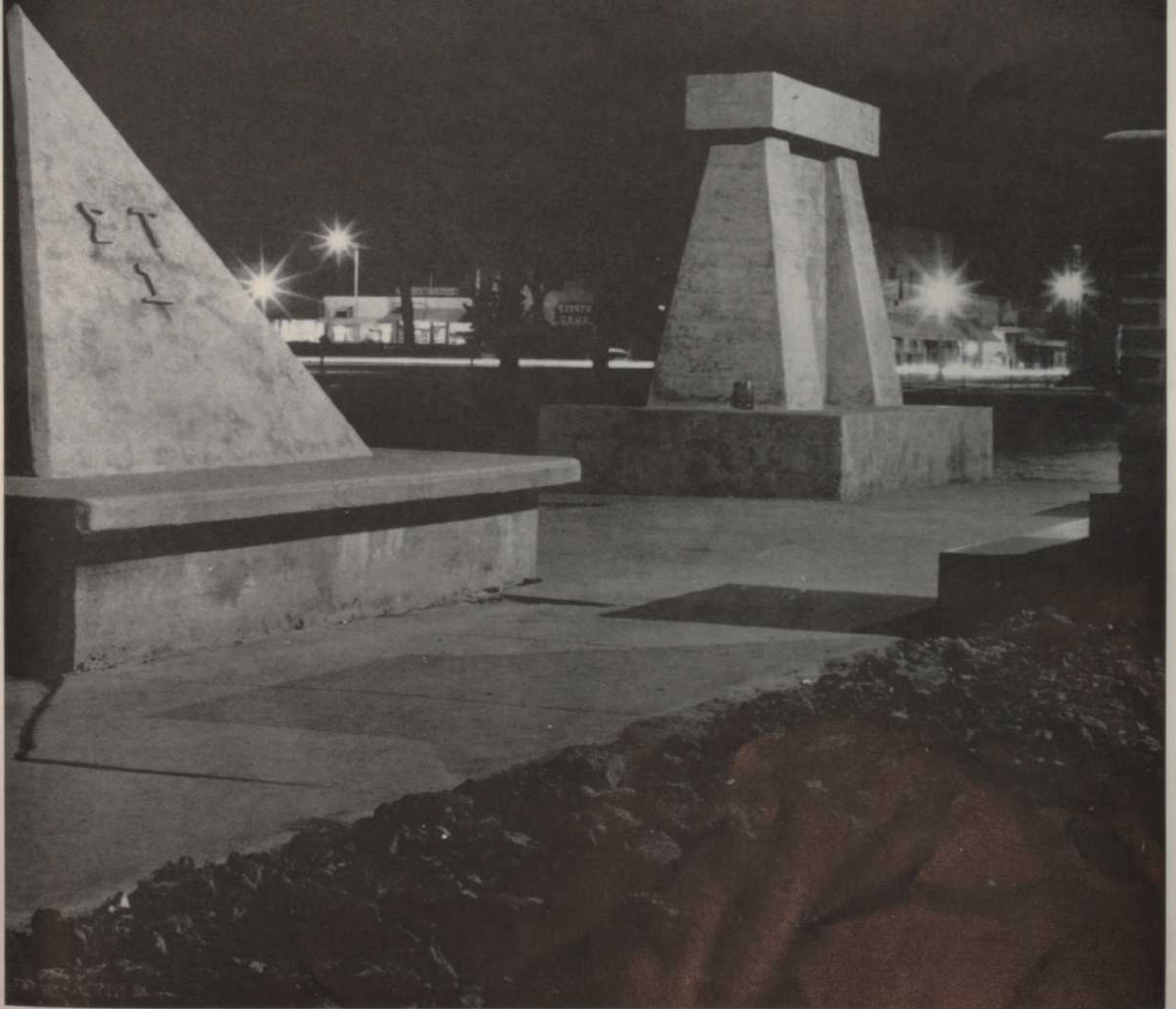
Campus Corner lights starburst behind stonework fronting the Engineering Building. It's a warm spring night. Note the pop bottle at right center.