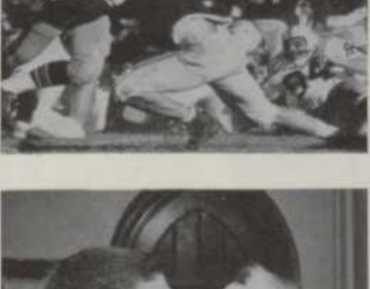
FAIR-HAIRED BOYS According to the prognosticators this is Big Red's Big Year. Now all it has to do is win the games . . . Page 11