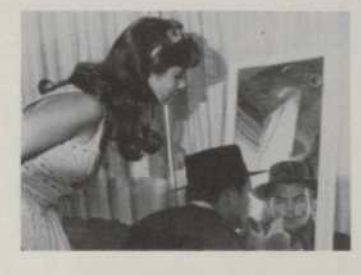
THE PLAY'S THE THING The hard work of one graduate and his entourage of drama students has brought entertaining plays to the Lake Murray area . . . Page 7