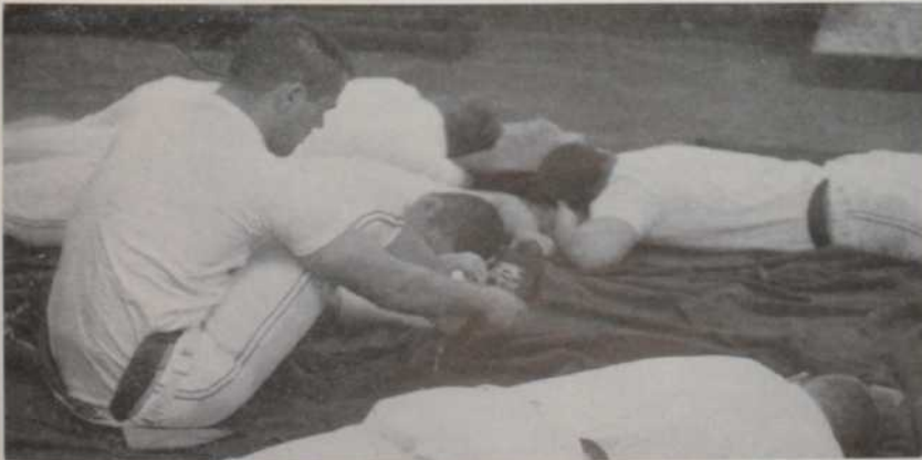
Players resting before the game

"Remember that it's been medically proven that when your body is telling you to quit you have gone only half as far as you can go. Remember your opponent is tired too; and if you keep the pressure on him by not quitting—he'll quit. In everything it's the same. When you are tired don't quit. Accomplish your objective, and then rest with success."—Wilkinson