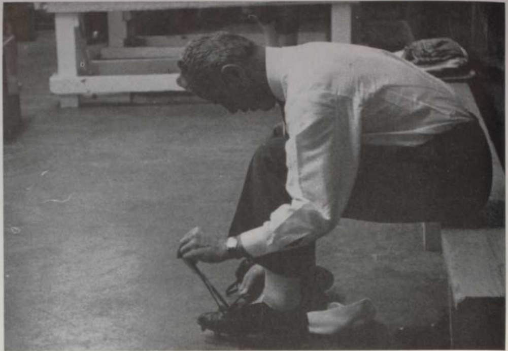
Next stop—the playing field

“As you go along the road of life you’ll find that there are easy paths branching off; and it’s a great temptation to take off down those paths—the easy, lazy way. Football’s the same. You play, and after a while you tire; and it’s easy to loaf. That’s normal—and that’s average. You have to be above-average to be successful. You must be tough all the way. And stay true to yourself. You may be able to fool the fans in the stand, the writers in the press box; but there’s one person you cannot fool, and that’s yourself. Play hard and stay true to yourself. It’s the only way you can stay true to Oklahoma tradition.” —Wilkinson