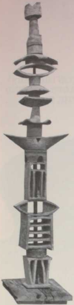
Smith—Ceramic Construction #1, 6'4" high, not for sale, valued at $200.