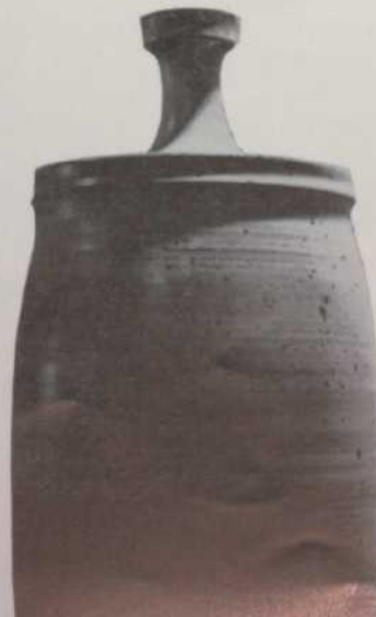
Corsaw—Jar, 14" high, $30.