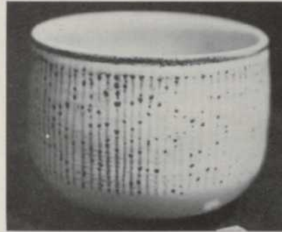
Corsaw—Bowl, 6" high, $10