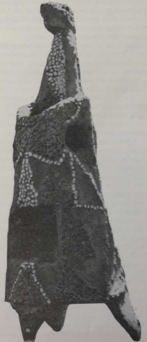
Smith—Witch Doctor, 42" high, $125.