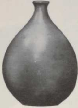
Corsaw—Vase, 9" high, $10