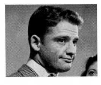
THE BUFFALO SKINNER O. U. alumni made a name for themselves in a recent off-Broadway production. ... Page 13