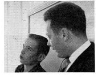
PRONONCEZ 'FLES' Every parent should know about FLES and how it can make Junior polylingual in no time. ... Page 4