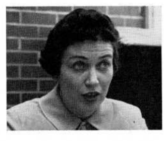
LOST RIB EDUCATION According to Dr. King most O. U. coeds miss not only diplomas but worthwhile instruction as well. . . . Page 8