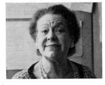
O. U.'S VISITING PROFESSORS Outsiders have brought charm, knowledge and penetrating observations to O. U.'s campus. ... Page 10