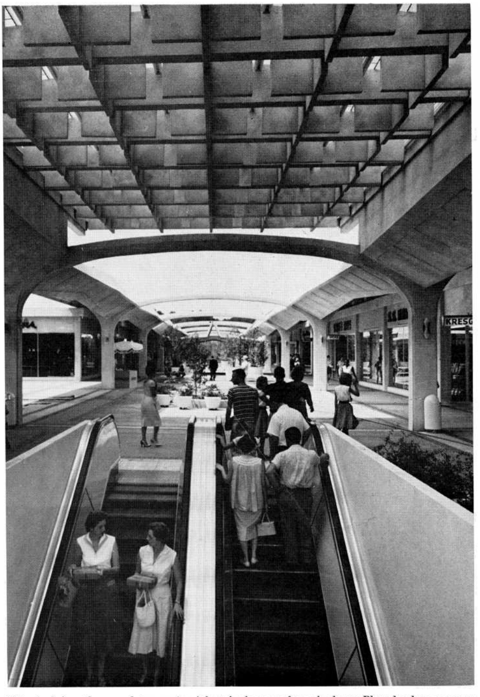
This shaded outdoor escalator carries Atlanta's shoppers from the lower Plaza level to an upper level built around a 1,014-foot central mall. Fifty-nine shops are located on the two levels.

sonality all its own. He wanted to create a place where people would like to come even if they had nothing to buy.