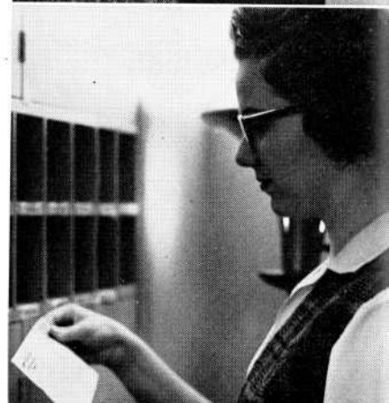
Phoned excuses from late coeds . . . Extra housework in the lounge . . . That all-important mail call . . .