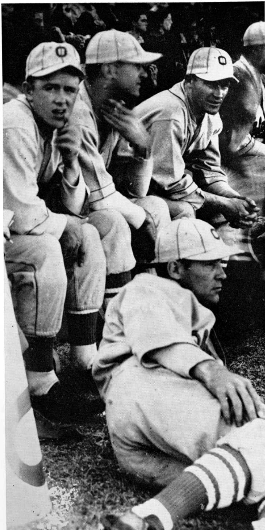
GOLDEN DAYS—The 1937 baseball team must have been in a tight spot when Heffner snapped this Sooner study. Identities should be easier than March's mystery men—as yet unnamed.

Class Reunions 1910 . . . . . Page 24 HAC . . . . . Page 25 1940 . . . . . Page 25 1930 . . . . . Page 26 1925 . . . . . Page 27 1935 . . . . . Page 28 1915 . . . . . Page 29 1920 . . . . . Page 30 1945 . . . . . Page 31 1955 . . . . . Page 31 1950 . . . . . Page 32