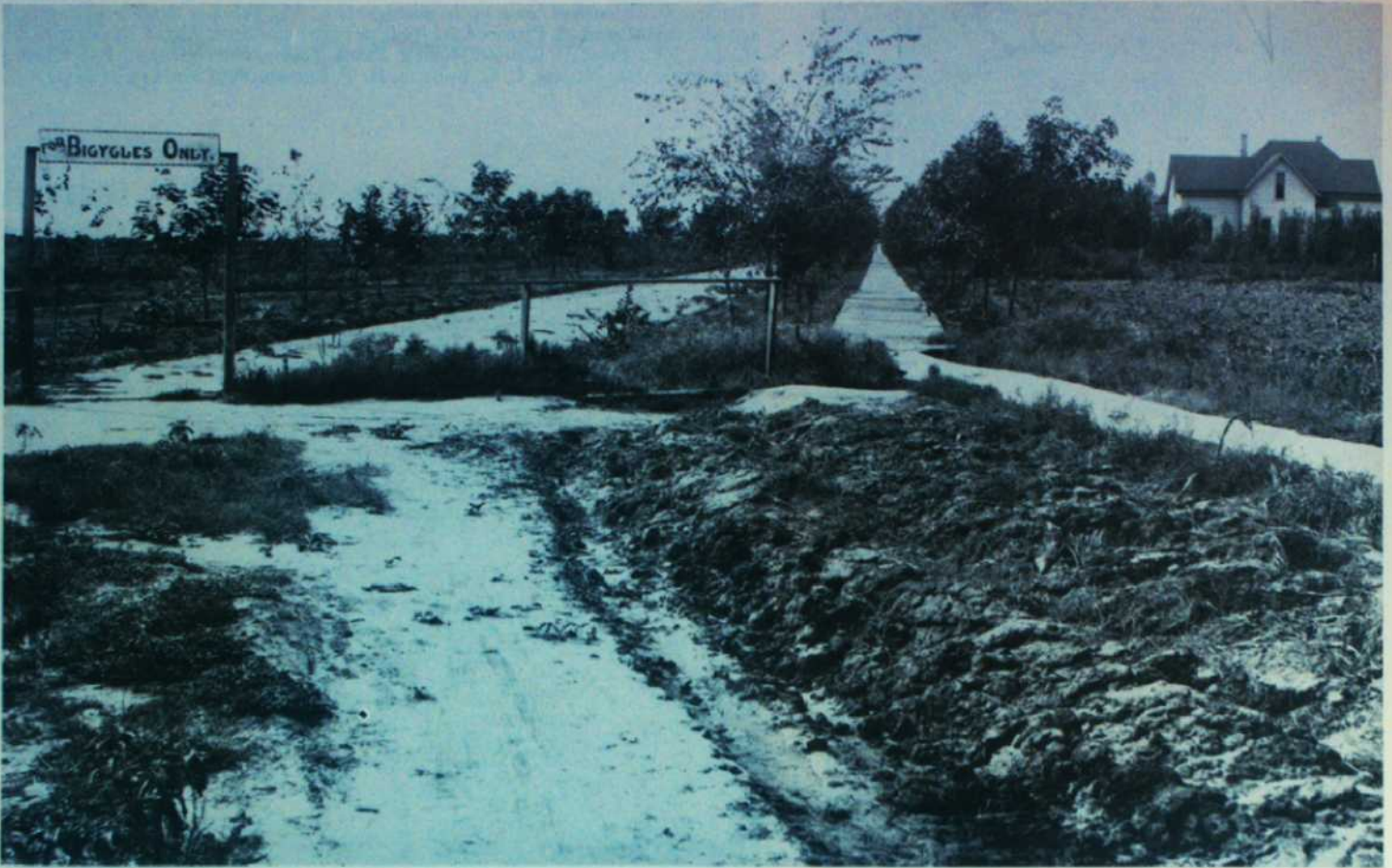
In Hume's day University Boulevard posed no parking problems, as this photograph so eloquently shows. But bicycles were problems then, also.