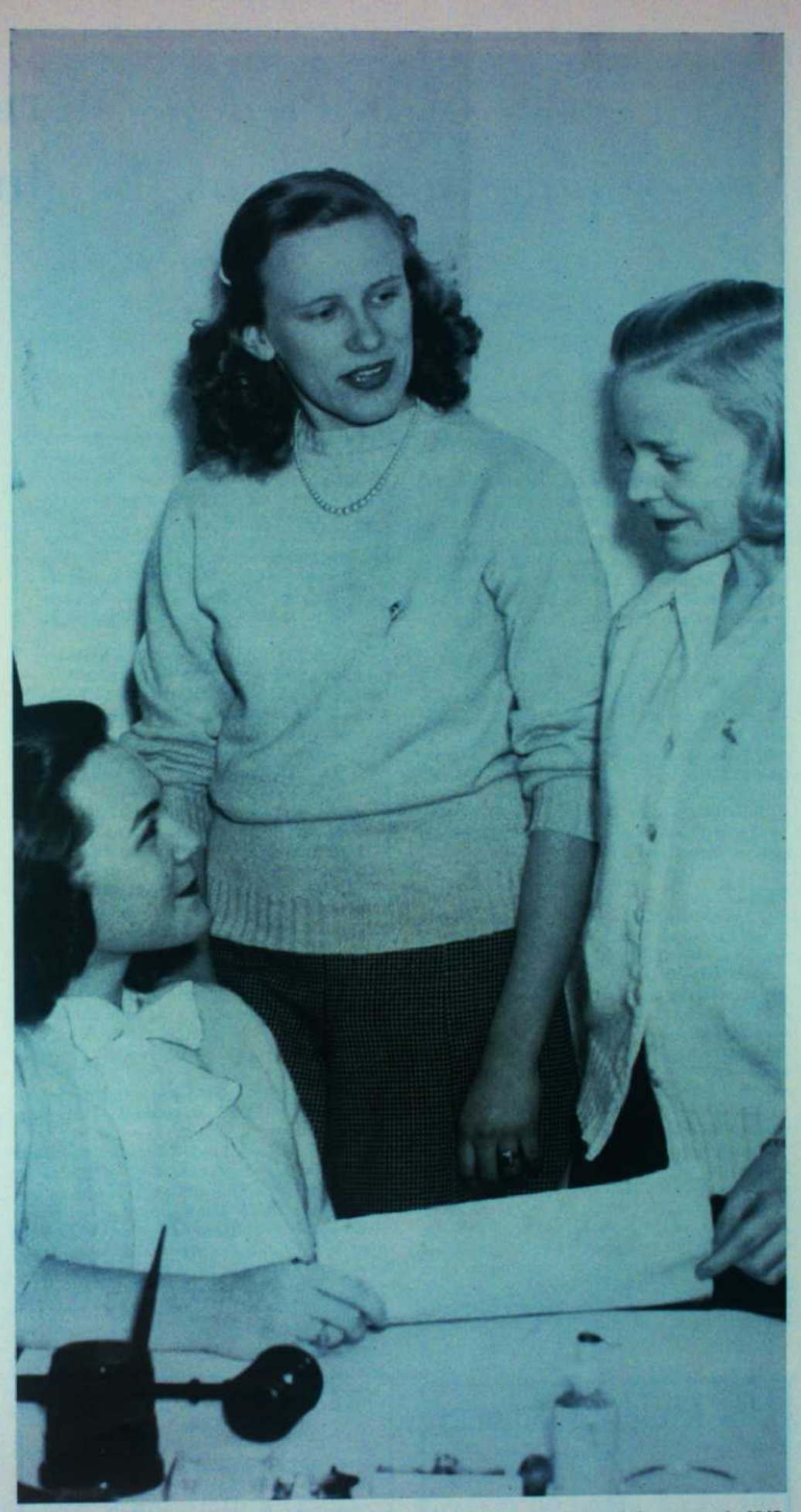
GOLDEN DAYS-Recognize these student leaders? Well, if you were around the campus in 1947, you undoubtedly will be able to give us their names. For November's pharmacists, turn to page 17.