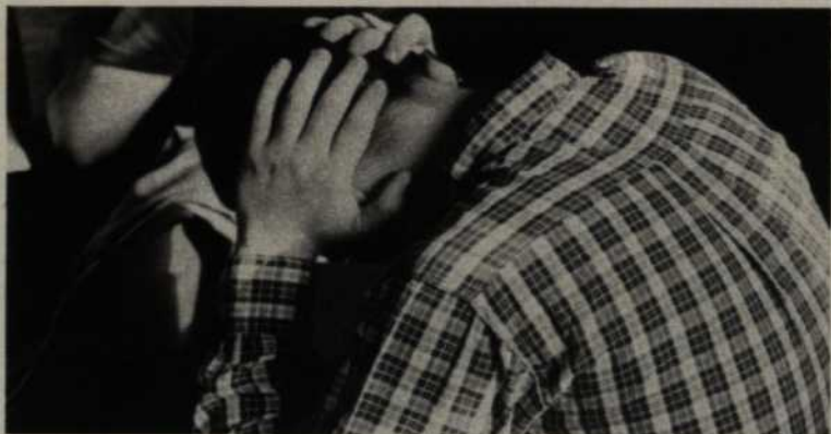
ST. LOUIS POST-DISPATCH

How well either system works varies greatly. “When you come right down to it,” said one member of our student panel, “honor must be inculcated in the years before college—in the home.”