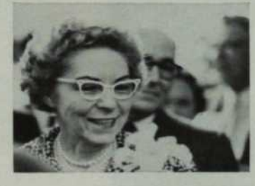
DISTINGUISHED SERVICE CITATIONS Five alumni have received the highest honor that the University and the Alumni Association can bestow. . . . Page 9