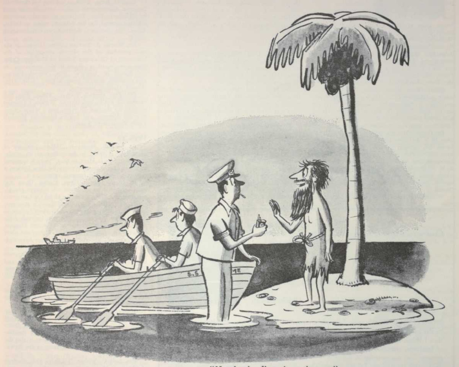
"No thanks, I've given them up"

Drawing by Cobean, © 1950 The New Yorker Magazine, Inc.