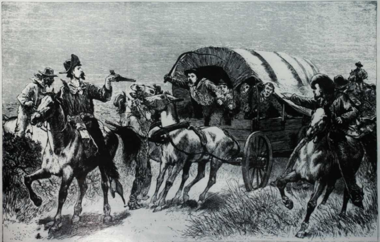
INDIAN TERRITORY—THE OKLAHOMA BOOMERS—UNITED STATES SCOUTS TURNING BACK INVADERS.

but even while their immediate goal was being denied them, the Boomers were prying open the door to the new territory