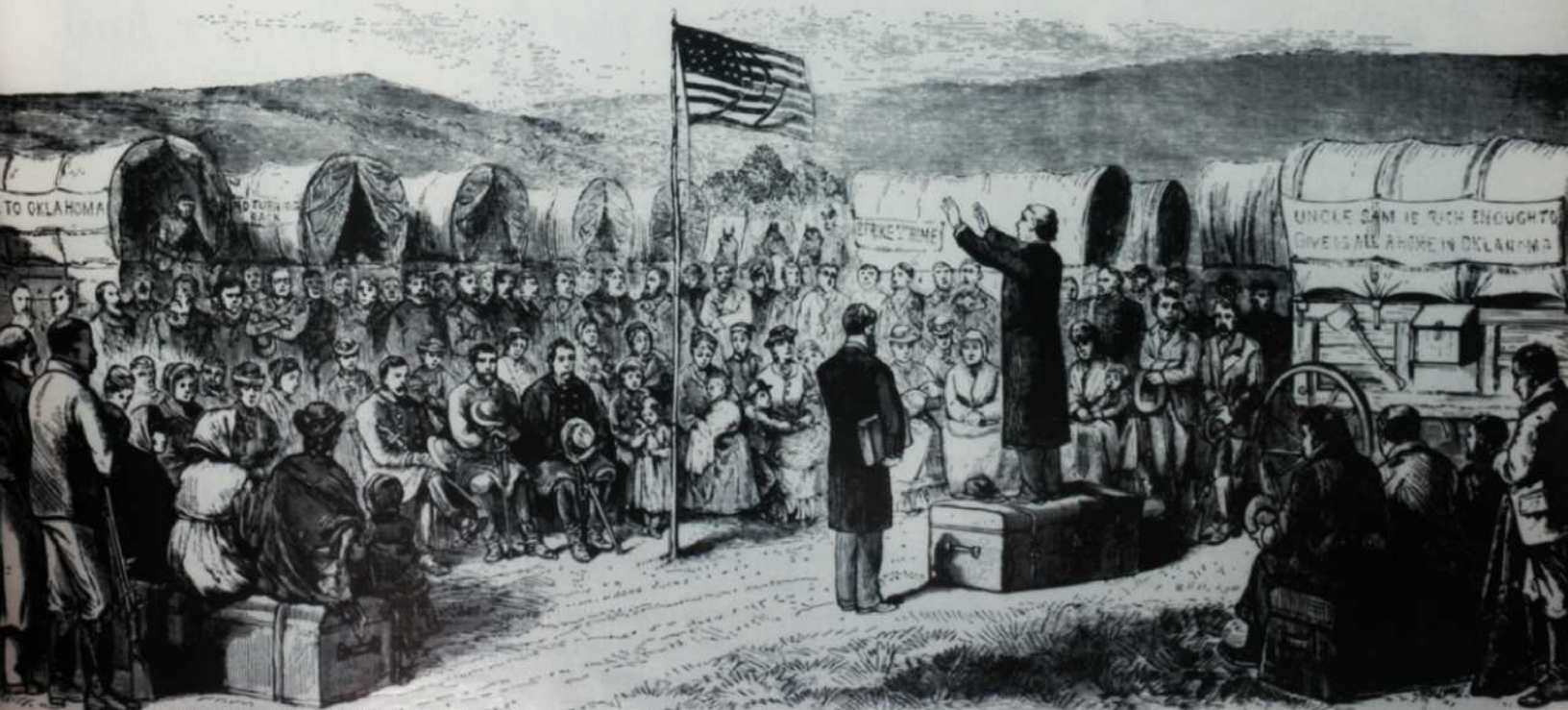
SUNDAY SERVICE IN CAMP.