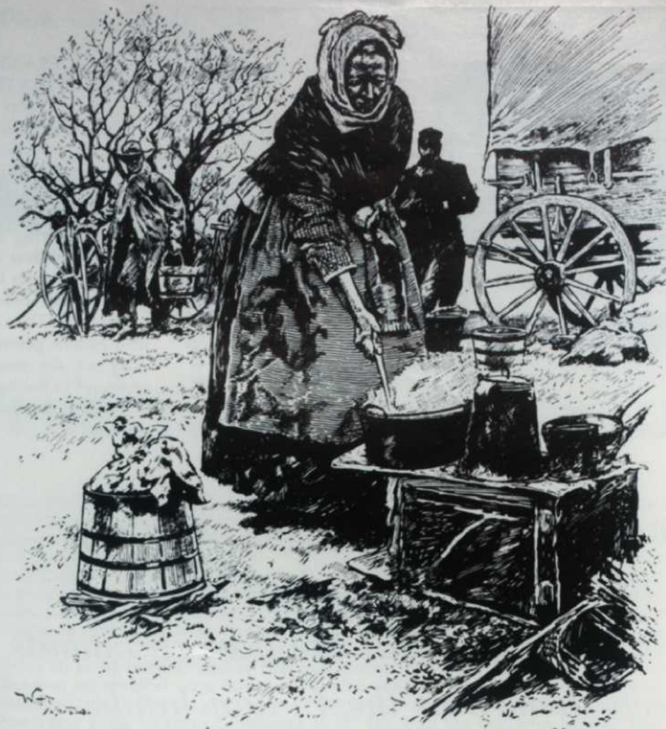
A "BOOMER'S" WIFE.