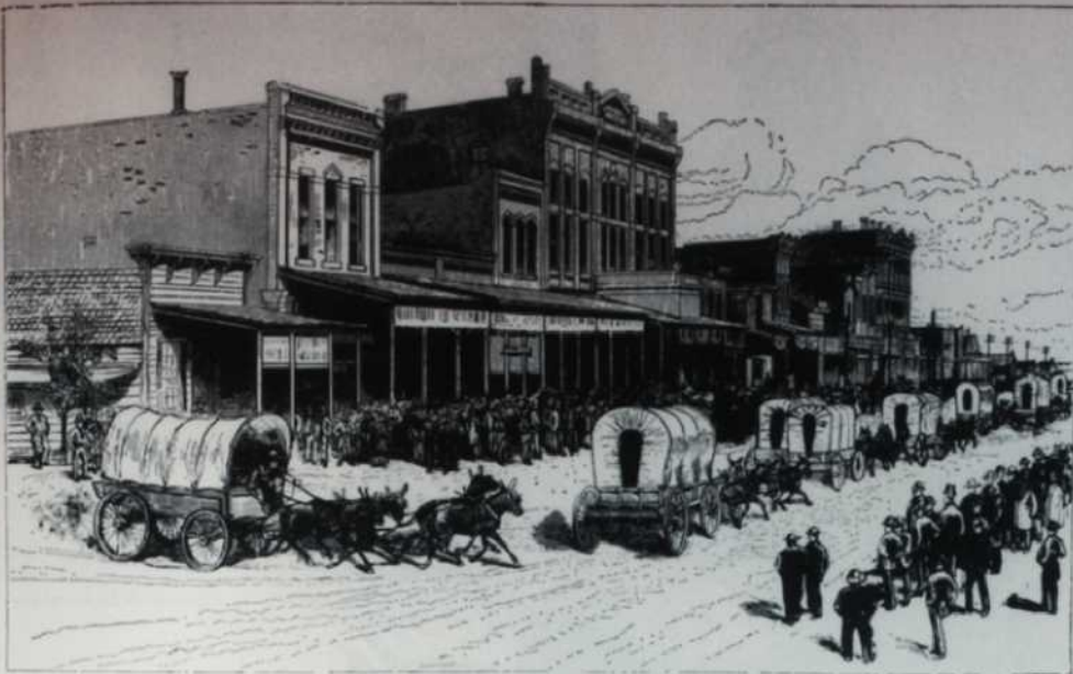
ARKANSAS.—OKLAHOMA BOOMERS LEAVING ARKANSAS CITY.—SEE PAGE 211.