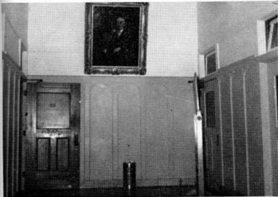
First floor changes are most evident around the Monnet portrait (above and right) and near the stairs (below).