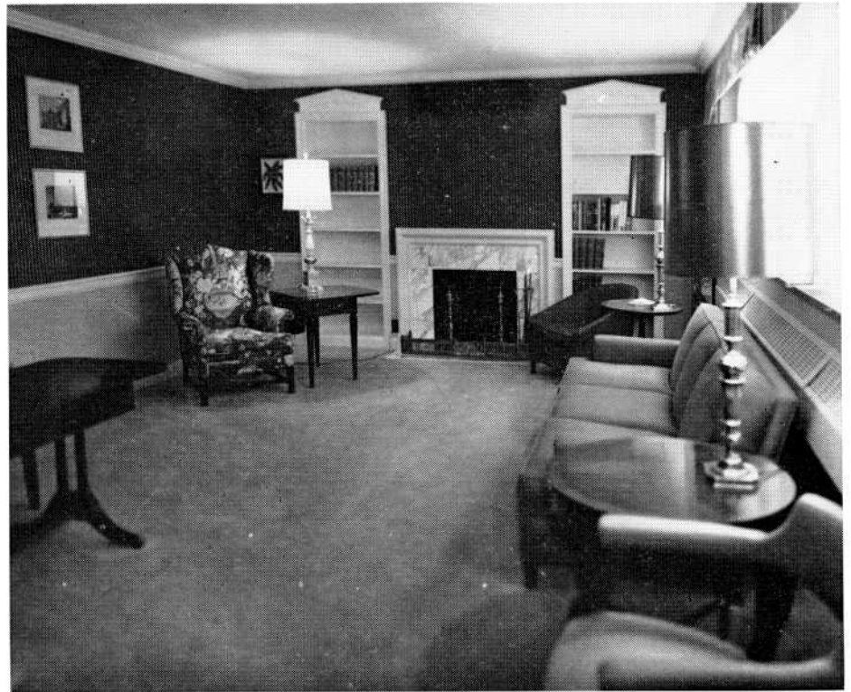
The Culp Room (above) gives the appearance of 18th century English with its wall-to-wall carpeting of heavy wool, off-white woodwork, marble facing around the fireplace and walls covered by rich florentine paper with red-striped flock. The drapery, surrounding the casement curtains at the window, is of a hard floral pattern with dark green background. The Georgian English style furniture includes a sofa covered with imported quilt weave material in old red, English wing chairs, mahogany desk and tables and pictures of old English subjects. All of the room's decorations were under the supervision of Robert Shead, Incorporated, Oklahoma City.