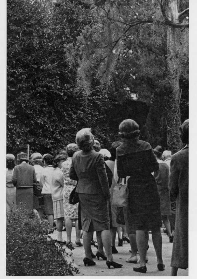
An excursion to our nation's oldest city, only 30 miles from Jacksonville, provides players' wives with an entertaining day of sightseeing and, yes, souvenir-buying, too.