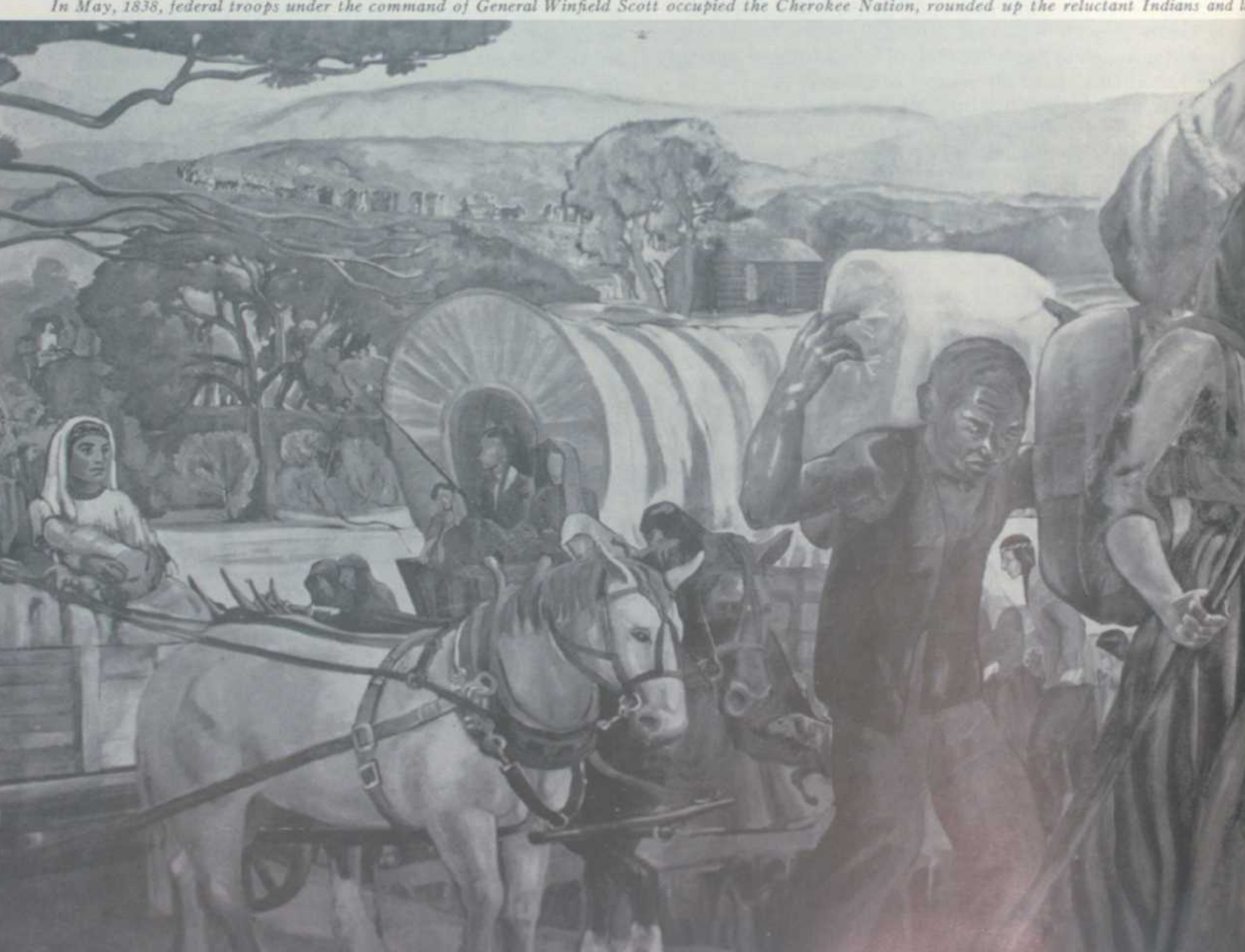
In May, 1838, federal troops under the command of General Winfield Scott occupied the Cherokee Nation, rounded up the reluctant Indians and li

At least two-thirds of the Cherokee Nation remained in