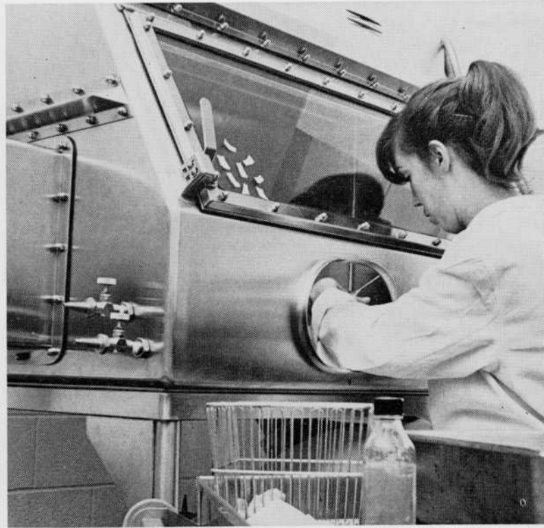
Noted scientist Dr. Commoner (above left) was guest speaker at the dedication ceremony. Above right, a protective hood enables a research assistant to work safely with potentially harmful organisms in the pathology lab. Spacious, well equipped labs like the one below are the rule in the imposing new building.