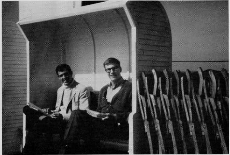
A favored pastime aboard the Queen Mary On ship two Rhodes Scholars looking scholarly