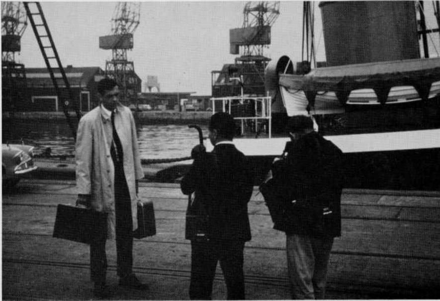
The great Princeton basketball player, Bill Bradley, indulges British photographers