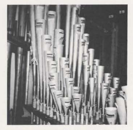
Two views taken in chambers of Wurlitzer 4/17 at Roosevelt Park Cemetary Gardena, Calif.