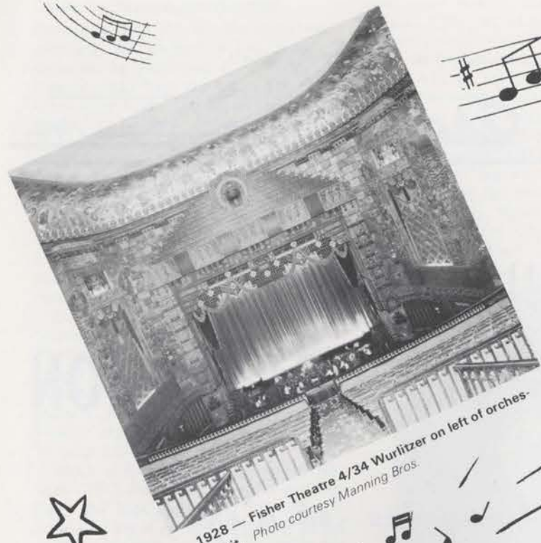
1928 — Fisher Theatre 4/34 Wurlitzer on left of orchestra pit.