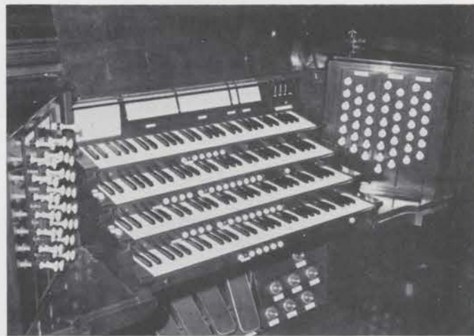
A 4/57 romantic, concert organ that has undergone many changes since 1876.

PLAN NOW TO "ORGANize" YOUR FUN IN THE MOTOR CITY IN '67 THE 1967 NATIONAL ATOE CONVENTION, DETROIT, MICHIGAN