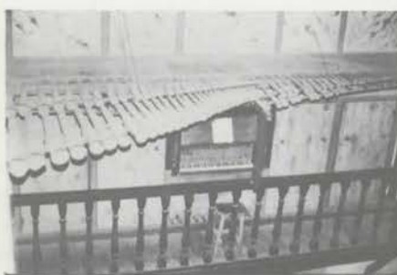
BAMBOO ORGAN—Lower section, one manual, 12 foot pedals, En chamade metal pipes are decorative fakes and are not used -- near Manila, Phillipines.