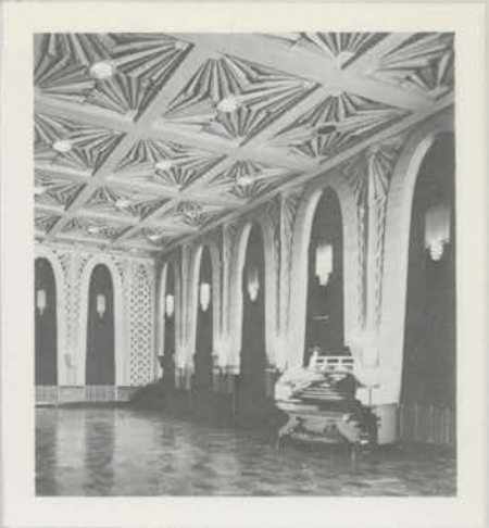
The WENR 3-13 Wurlitzer in Studio A.