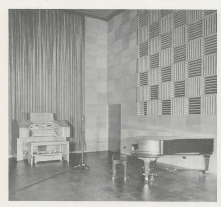
The WGN Kimball console in the original organ studio, Studio 3, adjacent to the Tribune Tower. Three Kimball ranks were added to the station's original 7 rank Wurlitzer.