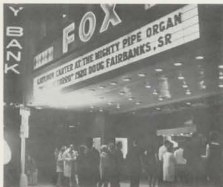
Early arrivals line up at the box office as the traditional searchlight sweeps the marquee. The silk-hatted doorman stands at the curb ready for the 'carriage trade'.

As all who read this magazine are aware, the organ was overhauled, repaired and improved by a group known as "the seven". They decided to limit their numbers to seven because "organization is less complex that way."