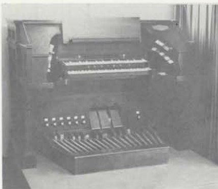
The console adds up to a puzzle. It's definitely unlike the usual Morton style 49 keydesk. We showed this photo to a former Morton factory employee and he identified it as the console shell used with models 75 and 85, 6 and 8 rankers. This one had been altered to house the roll-playing mechanism.

releathering, the organ boasts seven playing ranks plus a 16', 30-note Violone pedal extension, and is soon to have another rank added. Each of the two original wooden "swellbox" cases contain two ranks of pipes, while the 16' pedal pipes, percussions, and newer additions are contained in the third chamber built along-side the two stained walnut swellboxes. The "wall of music" from the rear of the store, with sound enhanced by fine "live" acoustics, is unmistakably that rich, deep "Morton sound."