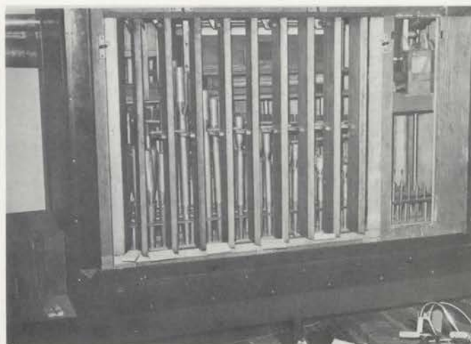
Open swell shutters on one of the two original pit swell boxes reveal same long stemmed Vox Humana pipes.