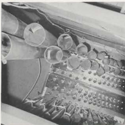
A squatty Kinura rank separates two chests of Tuba pipes.