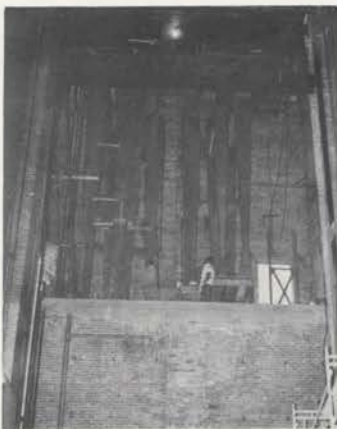
Rivoli crew members dwarfed by giant 32' diaphones on backstage wall.

The rest of this tale, the frantic effort to stay one step ahead of the demolition crew in removing this unique organ, is familiar to many. Unique — yes, very much so. It is a 3/15 Wurlitzer, a 260 Special, installed in 1925 — 8 years after the theatre opened. This organ replaced a straight organ, probably an Estey. The console was on a lift at the front left of the band car, and there were 4 chambers, each very shallow, allowing only 4 ranks plus a few offset chests for 16' pedal extensions in each chamber. This