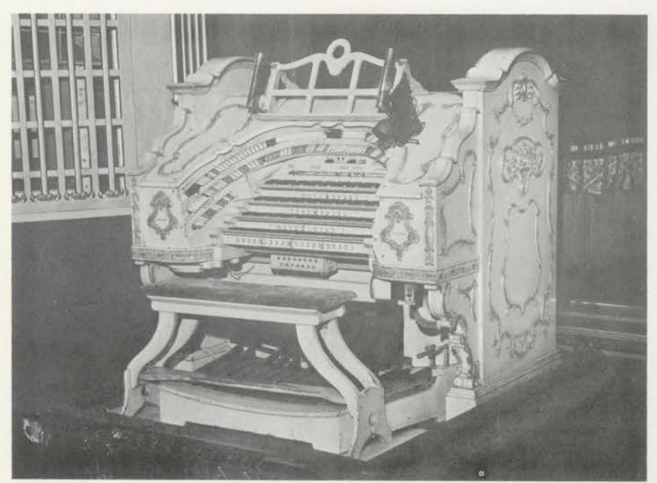
Opus No. 2170, a French design console, was shipped to the Odeon (Paramount) Theatre in Manchester, England, on 7/14/30. Clearly visible are the six stops added as a second row of tablets. The four black couplers were moved up from the bottom row, and the Vibraharp and Vibraharp Dampers stops were an added feature on the later issues of the Style 270.

The factory shipping list includes them as follows: