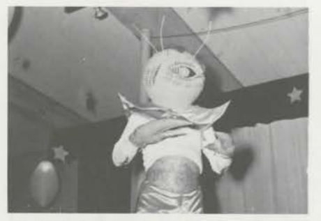
LEE LEES (background) continues to play very earthly music as this unearthly creature stalks the auditorium during the costume party.