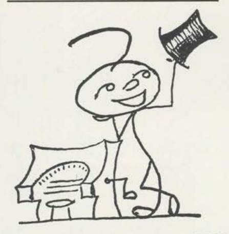
This is the last issue of THEATRE ORGAN-BOMBARDE

Beginning with the February 1970 issue, the official ATOS magazine will be called THEATRE ORGAN. Dropping off the name BOMBARDE from the masthead is being done with mixed feelings as we are a sentimental group and resist change. However, the Board of Directors decided to revert to the title of THEATRE ORGAN for reasons of simplification.