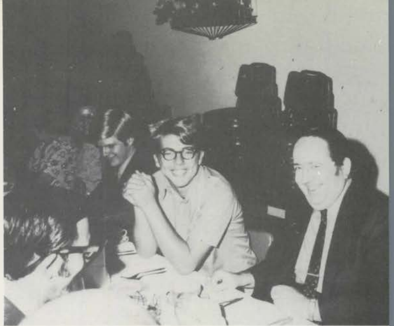
LUNCHEON AT HOLIDAY INN, FREDERICK, MD.