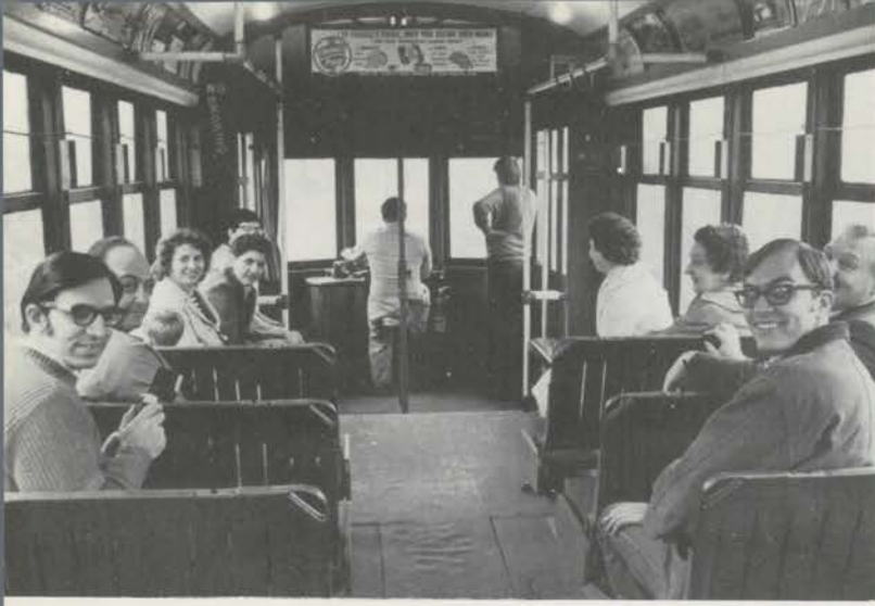
CLANG! CLANG! CLANG! GOES THE TROLLEY