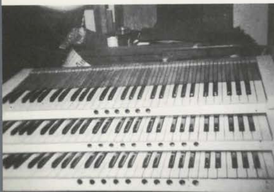
Keyboards after refinishing.

During the early 1930's, the period in which vaudeville was being phased out in this territory, I was a professional musician and it was my privilege to have performed both on stage and