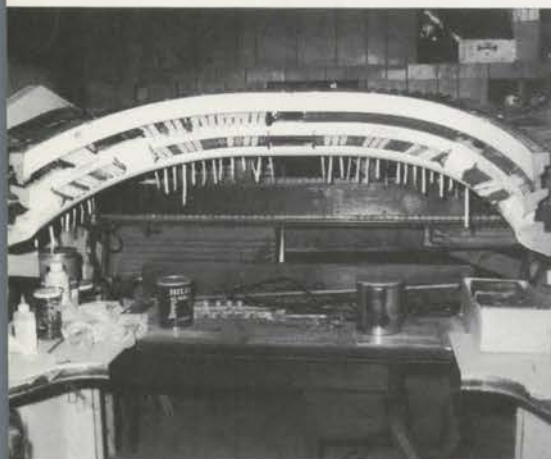
Console during process of re-installing stop tablets — pneumatics have been releathered.