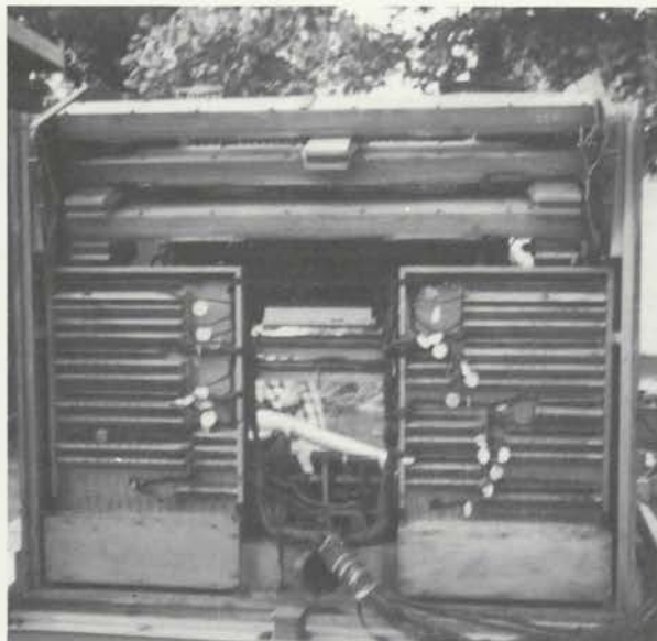
The back of the Morton console.