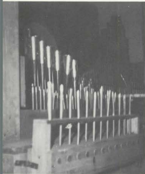
The pipework, still in the single, but divided chamber, at the Grand Riviera Theatre early in 1969.