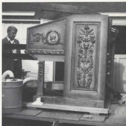
The decorative figure on the side of the console was dubbed "Marcus Aurelius" by the restoration crew.

The left side of the console remained plain because that side was next to the wall of the organ pit and hidden from public view. However, the rest of the console, including the