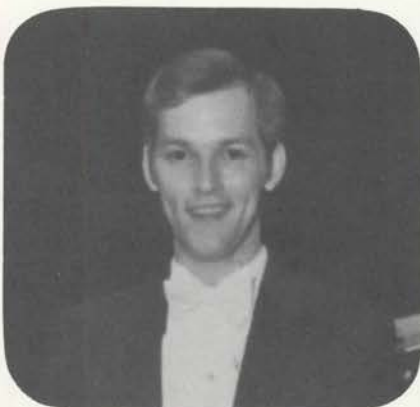
Lyn Larsen

Same organ, different player. Totally different result. Here the instrument provides a palette for the subtle tone colors and sophisticated arrange-