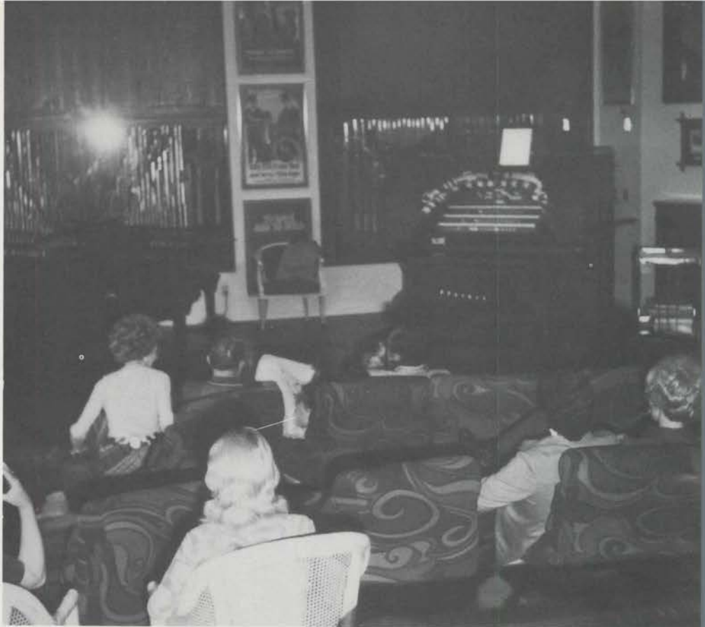
The Music Room. Main Chamber (left) and Solo Chamber (behind console) are seen through plate glass. Shutters are above windows. A portion of the Percussion Chamber may be seen at upper right of photo. Here, arriving guests wait for the concert to start.

cable so it can be set back away from the chambers on its dolly. However, for the recording session and subsequent demo-concert, the console was placed fairly close to the chambers (see photos) to allow for seating space for the guests.