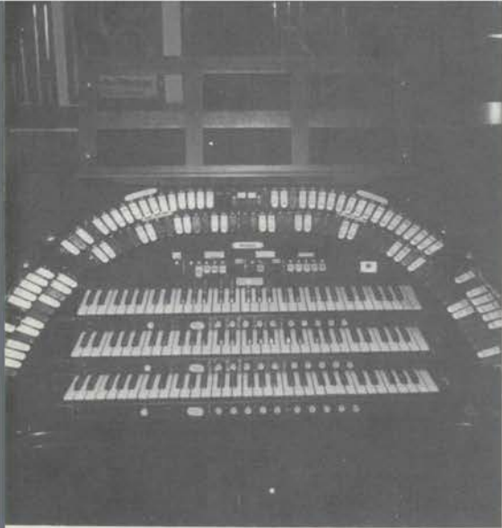
Console shell is a standard style 260 Wur-litzer with scrollwork above stopkeys.