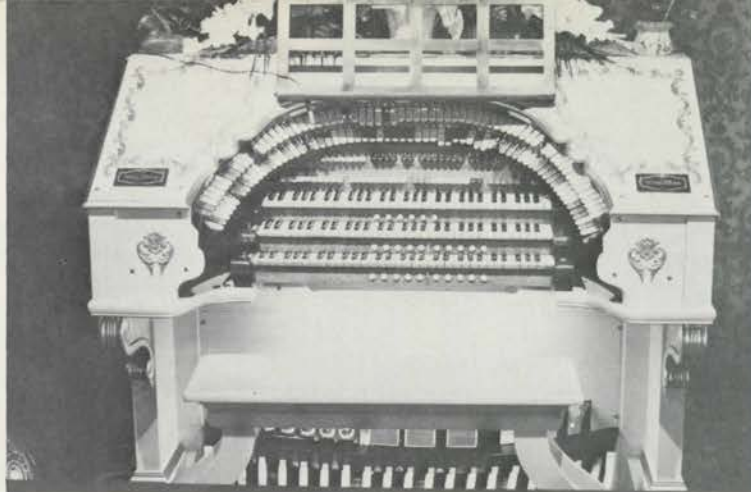
The 3/19 Wurlitzer at the Bella Roma Restaurant.