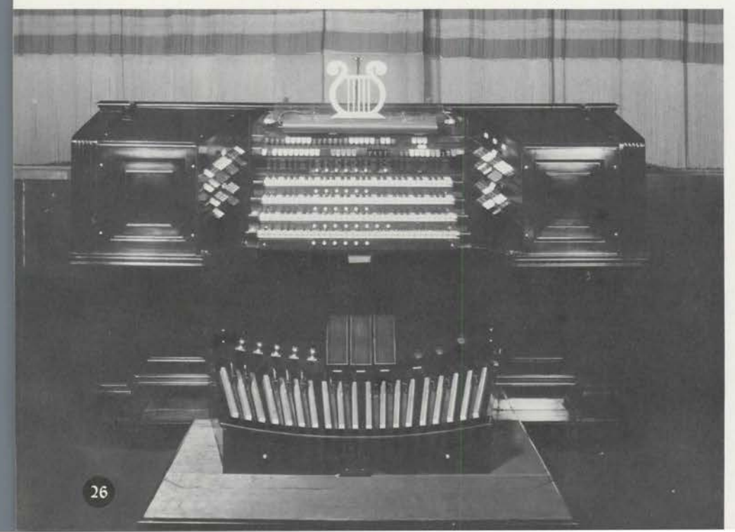
The 4/14 Kilgen in the Civic Auditorium, Oklahoma City.

The dedication was opened by the mayor presenting a large bronze plaque with the heading Kilgen Organ Restoration 1977, and inscribed with the names of the mayor, city council, organ committee, and builder, it has been installed on the wall of the beautiful entry lobby of