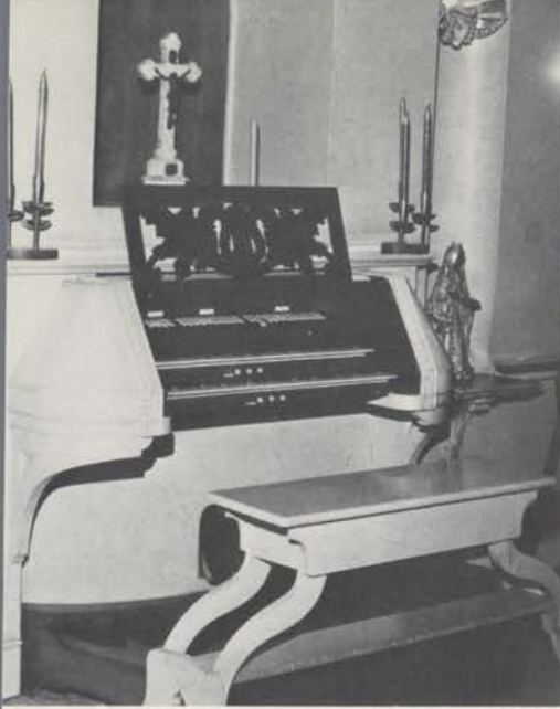
Two-manual console in Chapel plays the echo organ controlling four ranks of pipes. The console features nine couplers.

The echo organ can also be played from swell manual of the main organ.