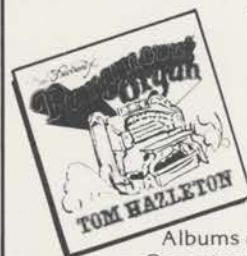
Tom Hazleton on the Paramount Organ

Available only by mail Albums @ $5.95 + tax Cassettes @ $6.95 + tax