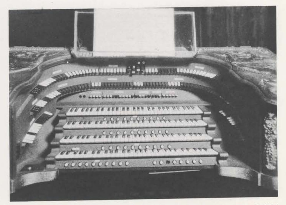
Barton 16 ranks, Coronado Theatre, Rockford, III., 1929-30.

The specifications of the organ as now installed are as follows:----