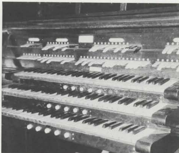
Close-up of the R-20 model Wurlitzer console, Tokyo.