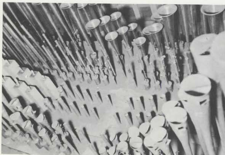
Close-up of oboe horn, solo scale tibia clausa & brass trumpet, solo chamber, Tokyo Wurlitzer.