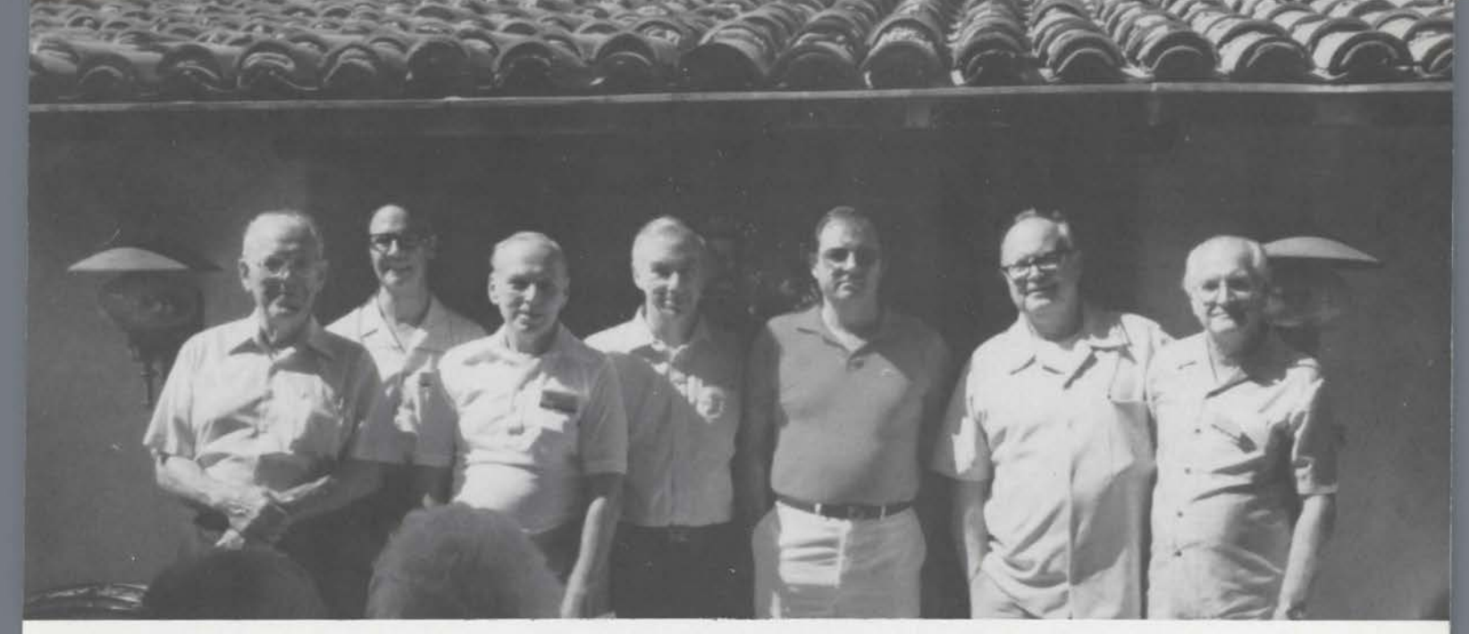
Seven past Presidents at chapter party celebrating 25 years.