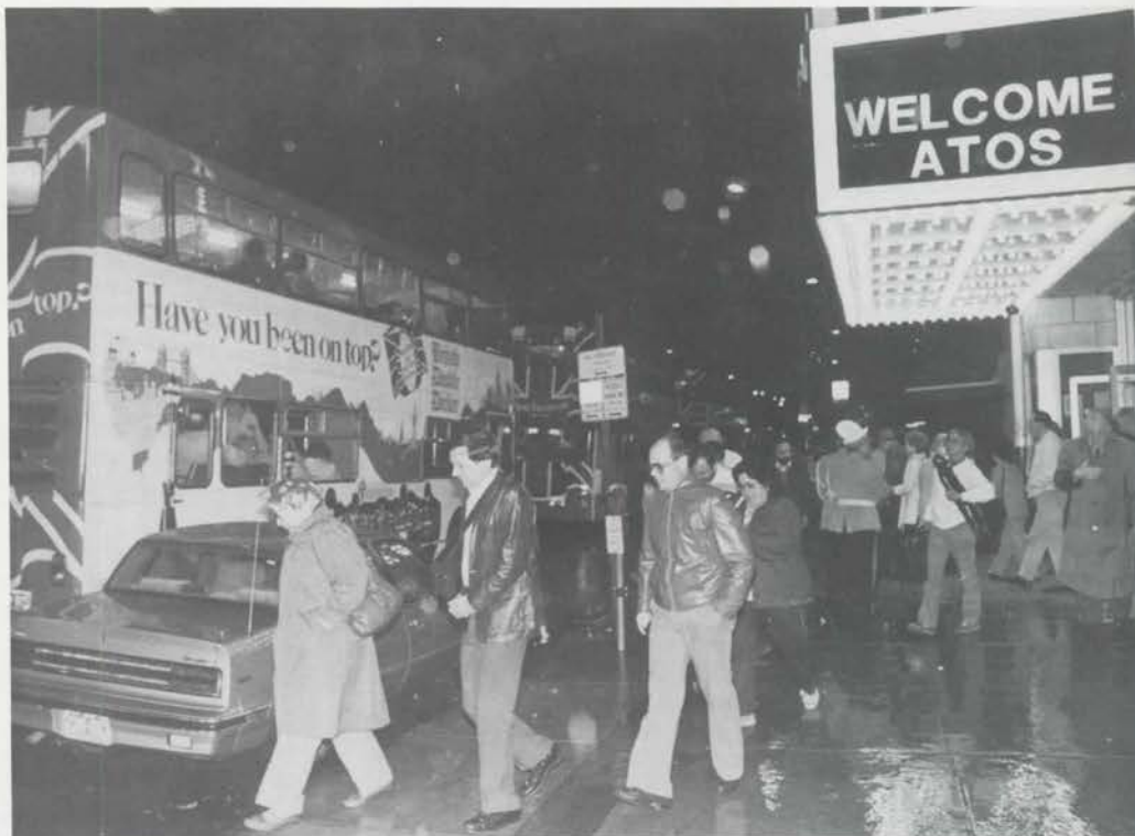
Double-decker busses were our transportation to the Organ Grinder for the late-night Jam Session on Friday.