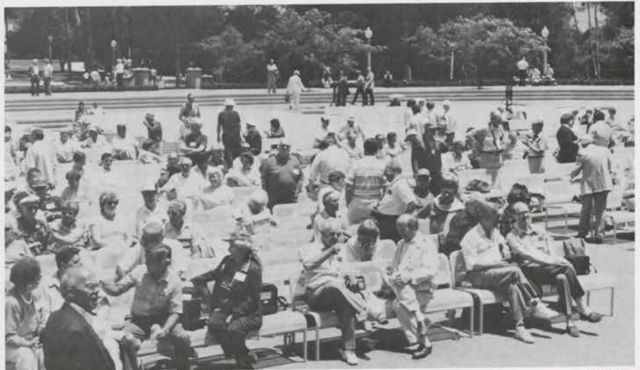
Waiting for the concert to begin at Balboa Park.