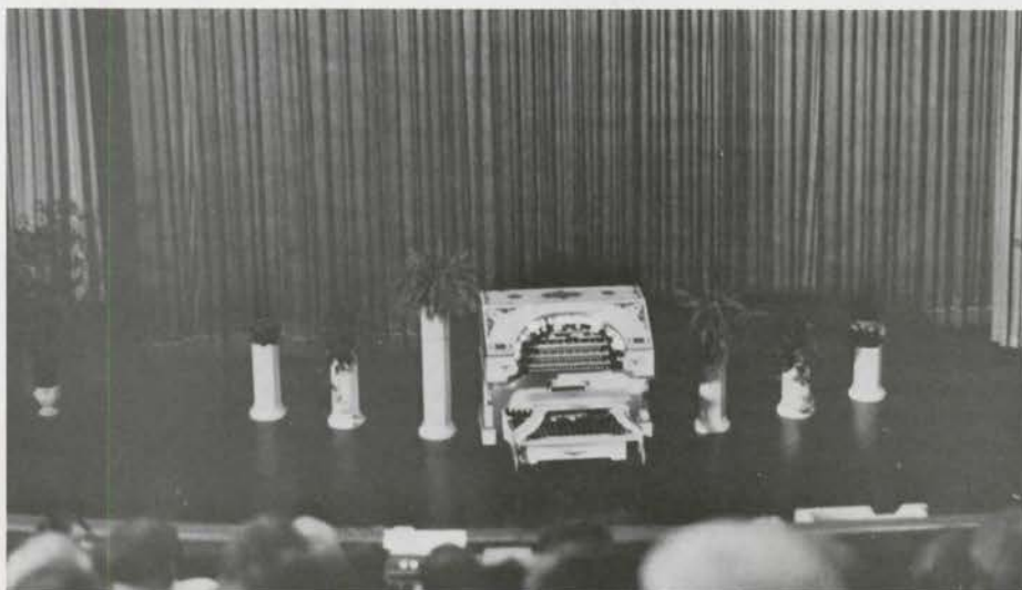
Stage at California Theatre ready for George.