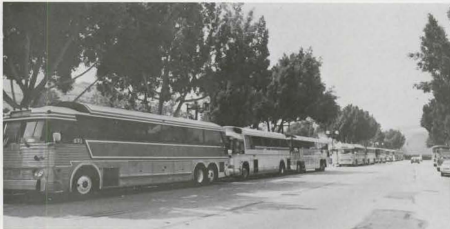
Just a few of the busses that carried ATOSers to San Diego.