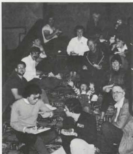
YTOE-Local chapter Christmas party group eating on the stairway.

"Working in between tight high school and college schedules, plus working schedules, they certainly do know how to produce a pleasant and happy party and show. Their budget and expenses were right on target, too. Not only have they shown they can design, develop and deliver, they have also set a good example."