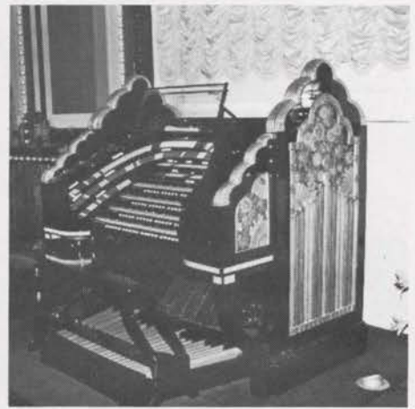
Mesa Organ Stop 4/48 Wurlitzer.

This means that you, the listener, can expect some of the best convention programs possible. We have made it our goal to see that when you leave Phoenix, you will have had a great time, heard some excellent organs, and heard some of the best theatre organ performers alive today.