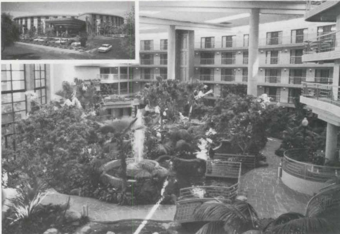
Atrium in Embassy Suites Camelback.