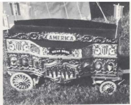
America — sister to the Asia. Original was built in 1904, along with Europe and Africa. (The top of the original Africa is on display in Greenfield Village.)