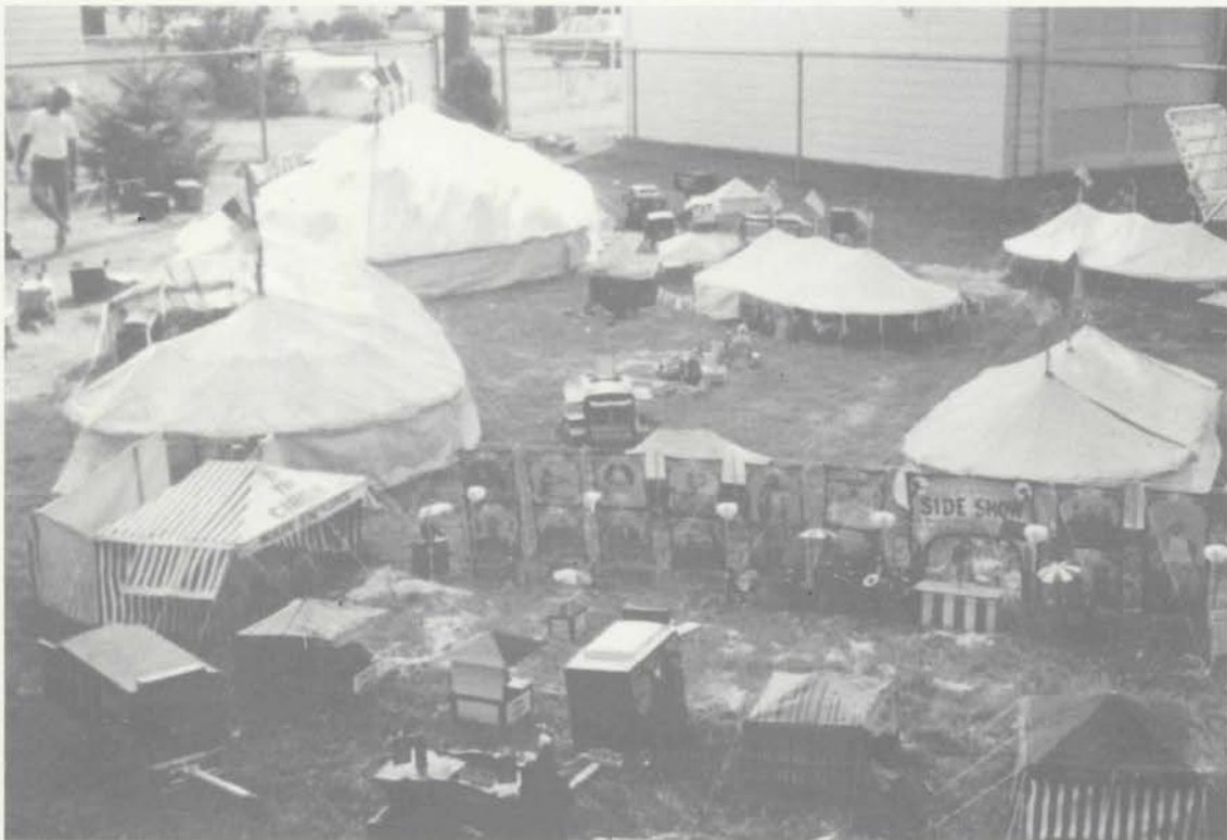
The tent at left-center measures 6 feet by 15 feet, while the Big-Top (upper left) is 12 feet wide and 24 feet long. Some 4000 yards of thread and 1000 yards of rope were used by Herb Head in the making of this miniature Big Top.

An unusual feature of this year's convention in Detroit will be a chance to see the Head Bros Circus, built and displayed by Motor City and Wolverine member, Herb Head. This 1" to 1' scale model will be a part of the Sunday morning and afternoon activities.