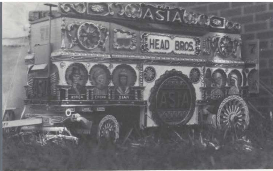
Asia Tableau — the original wagon was built in 1903 for the Barnum & Bailey Congress of Nations Parade. This miniature is 11" high and 20" long.