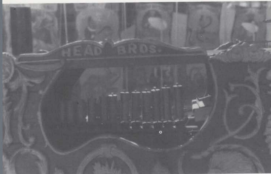
The original wagon was built to house the steam calliope for the Pawnee Bill Wild West Show. This miniature is 11" high and 16" long.