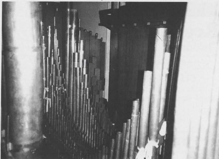
Main Chamber in FOX-Hanford 16' (metal) Diaphone is to extreme left.

8-2, Orchestral Oboe 8, Harmonic Tuba 16-8 (on 15" wind pressure), and the English Horn 8. The original console stoplist has been respecified to reflect more modern styles of theatre organ playing. There are no manual Clarion, Bourdons or tremulated English Horns! This, coupled with the fact all basses below 4' are off tremulant, all contribute to the big sound of this organ. Another factor is the auditorium itself. Being atmospheric, the ceiling is essentially a large, parabolic reflector. The organ mixes well to all parts of the house, even under the balcony.