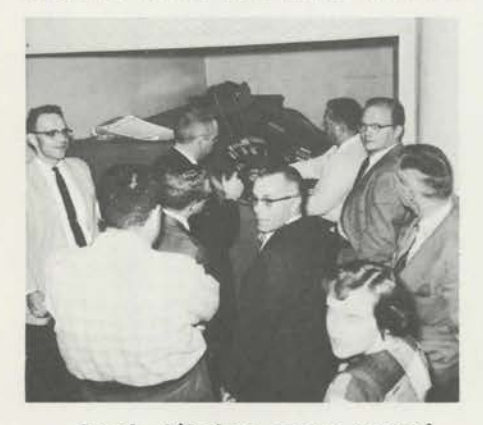
Land O'Lakes group around console at WCCO Studio.

Several members played during the early part of the evening. We are fortunate in having so many good organists in our ranks. We then had a short business meeting at which time the