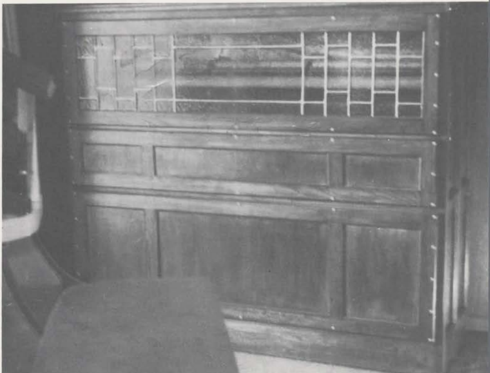
Charles Evans added this beautifully encased piano to "The Moon River" Wurlitzer.